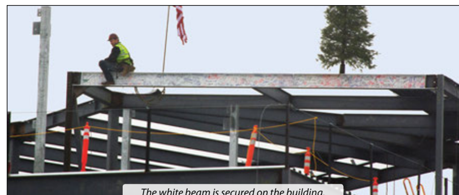
The white beam is secured on the building

June – First exterior sheathing goes on; brick goes up!