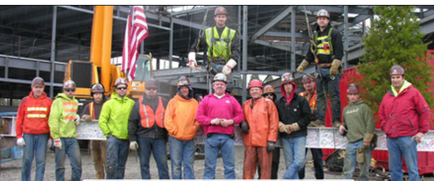
Construction workers pose for a Topp<mark>ing Off</mark> ceremonial