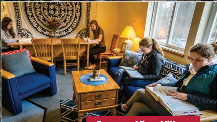
Campus View Village