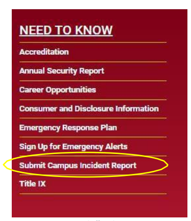
Figure 1List with "Submit Campus Incident Report" circled in yellow

Under the "NEED TO KNOW", click on "Submit Campus Incident Report"