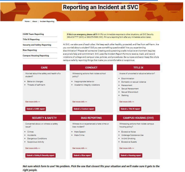
Figure 2Graphic of main reporting page

https://www.skagit.edu/about/incident-reporting/